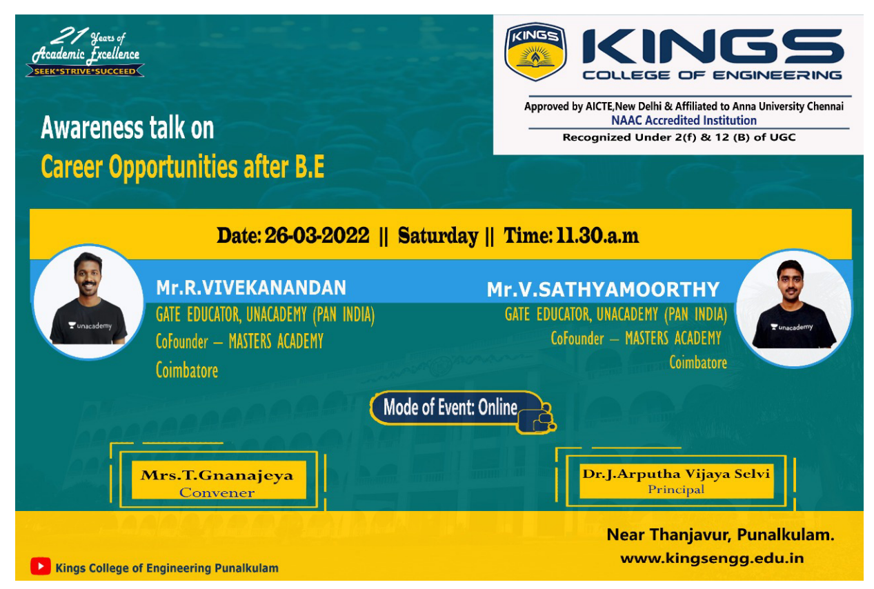
Webinar - Brochure